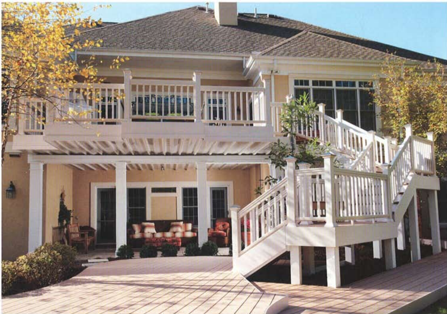
An alternative to wood decks and railings, TimberTech® composite products offer an attractive, low-maintenance and extremely durable substitute to treated woods

them because they are a breeze to install and are very customizable. With the introduction of XLM decking, we decided to offer exact color match railing choices that complement the low-maintenance decking boards.”