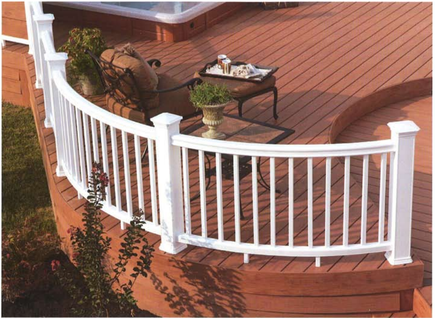
(above) The Coastal White RadianceRail® creates an attractive design by focusing attention to the curved detail of the deck (facing page) Outstanding in its brilliance, the Coastal White RadianceRail gleams against the teak decking and gorgeous view