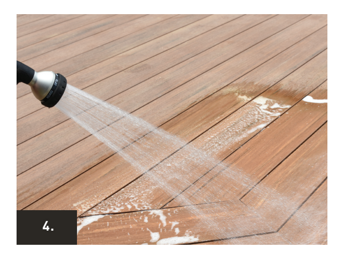
Rinse the treated area with clean water. For best results, dry or remove standing water with a towel or sponge mop. Then allow the deck to air dry completely. Note that any residual cleaner residue can leave a difficult to remove surface film. Always rinse thoroughly and never allow the cleaner to dry or evaporate on the surface prior to rinsing. For stubborn or missed areas, or areas where cleaner may have dried, repeat the cleaning process.