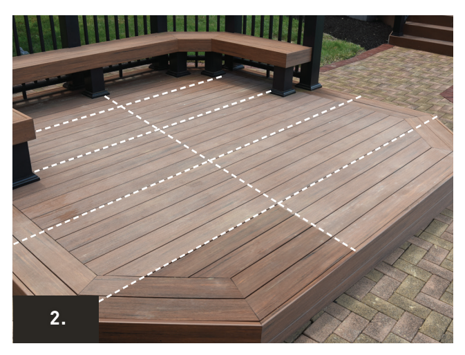
Working in one smaller area at a time, saturate with the diluted cleaner and allow it to stand on the surface for 30-60 seconds. DO NOT allow the cleaner to dry or evaporate before scrubbing. Avoid cleaning in direct sunlight as the heat generated may cause the surface to dry quickly as you attempt to clean. Rinse each section thoroughly after scrubbing and before soaking the next section.