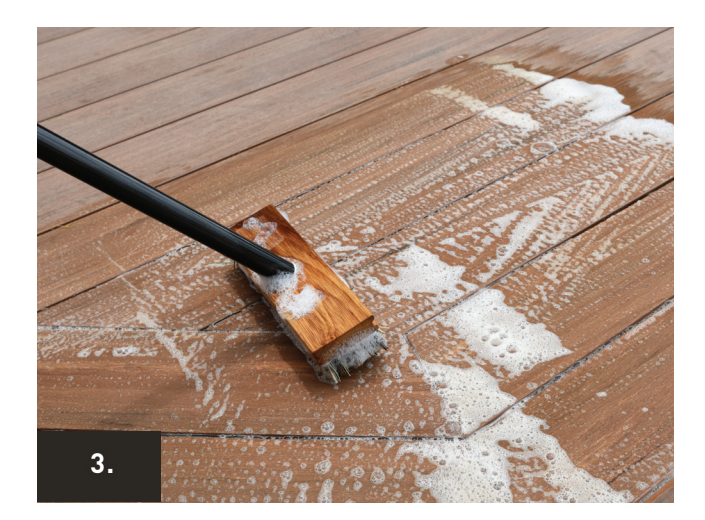
Using the recommended brush and extension handle, scrub using downward pressure; first scrubbing in the direction of the grain and then against the grain working the cleaner into the surface texture. D0 NOT allow the treated area to dry before rinsing thoroughly as this will allow dirt residue to dry in the surface texture.