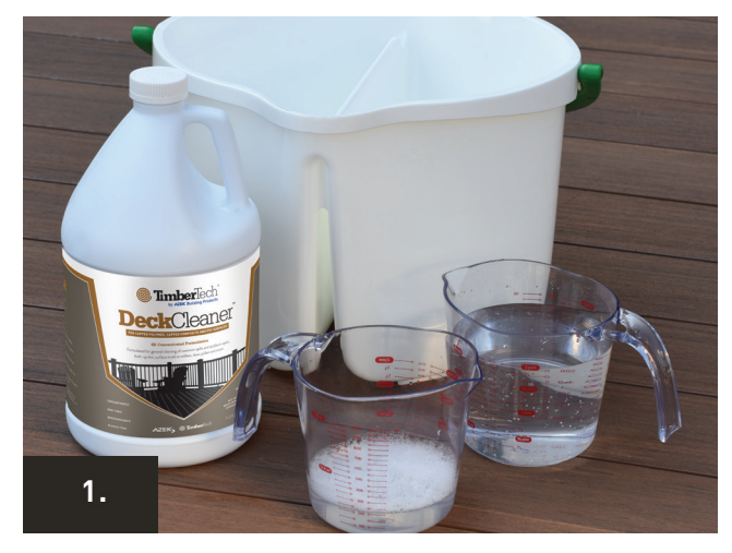
Shake well. Dilute TimberTech DeckCleaner mixing 1 part cleaner to 3 parts water. One gallon of diluted cleaner will cover approximately 1,000 square feet of surface area.

A power washer can be used for RINSING ONLY with TimberTech Deck or Porch. The recommended maximum pressure is 1,500 psi. A fan tip nozzle should be used. Spray in the direction of the grain pattern, never across the grain, to avoid damaging the product. Use caution not to damage the material and always take proper safety precautions when operating a power washer.